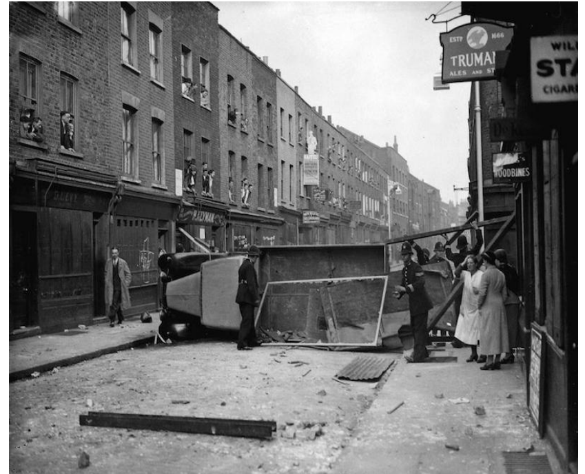
Jews rioting against Time, erected barricades and fought the police and fascists,