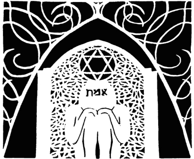
Inside a mountain, inside a shul—a mountain golem